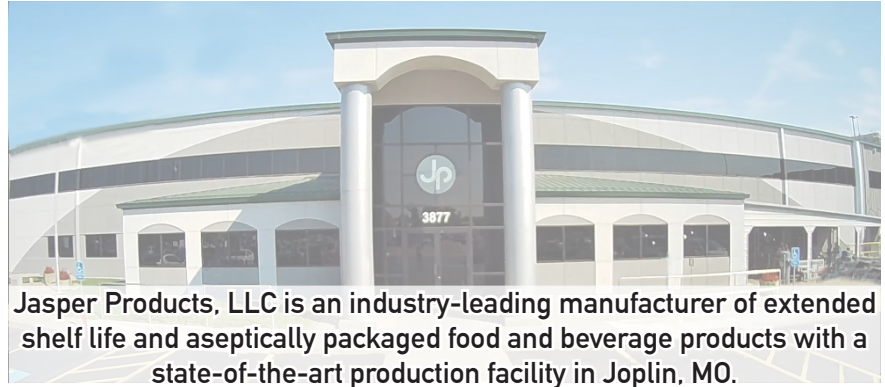
Jasper Products, LLC is an industry-leading manufacturer of extended shelf life and aseptically packaged food and beverage products with a state-of-the-art production facility in Joplin, MO.

Due to growing market share and customer base we are filling the following open positions: